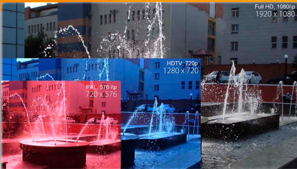
Comparison of traditional CCTV image resolution of D1 vs HD vs Full HD

Lotus LCIR-H series is cost-effective full HD1080P surveillance cameras designed for indoor/outdoor day/night video surveillance system using infrared. It's image is 1928 (H) x 1088 (V), approx. 2.1M pixels resolution that adopts a 2.8µm unit pixel manufacturing technology to provide high sensitivity performance and high signal-to-noise ratio (SNR) to obtain clear images that enable to sufficiently discriminate subjects even in dark conditions.